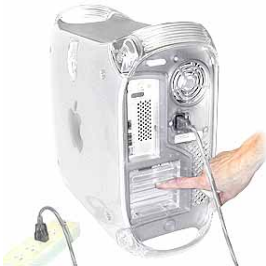
Power Mac G4 (QuickSivers)